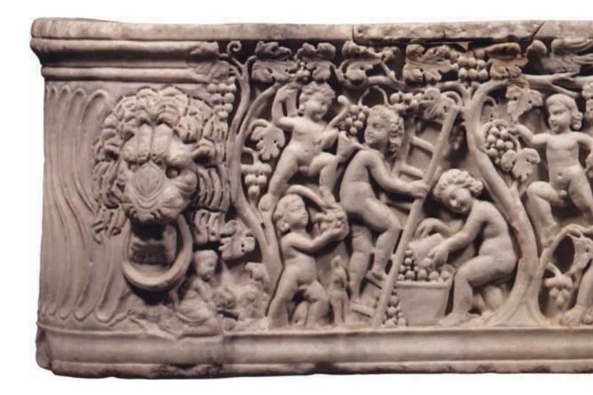
Sarcophagus Representing a Dionysiac Vintage Festival. Roman, A.D. 290–300. Marble, H: 53.1 (20% in.); L: 190 cm (74<sup>1</sup>‰ in.). Los Angeles, J. Paul Getty Museum, 2008.14.

Rarely depicted during the Middle Ages, naked or barely clad infants were reintroduced into art during the Renaissance. In keeping with the broad range of meanings established for them in antiquity, they were known as spiritelli , or airy sprites, suggestive of the playful innocence and carefree impetus of youth. As such, they frequently carry coats of arms or torches, garlands, and other festive paraphernalia, including musical instruments.